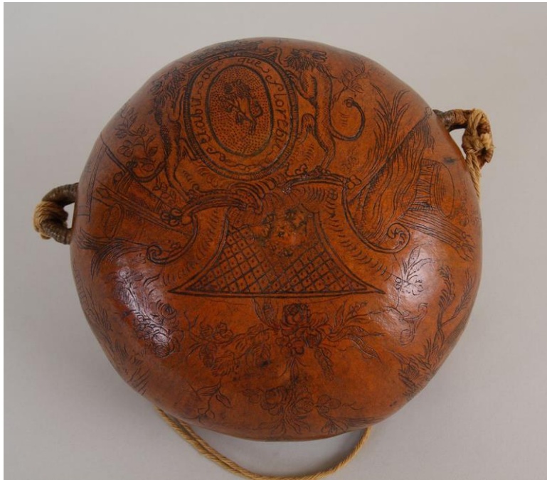
Back - Credit - Musée Stewart, l'Île Sainte-Hélène, Quebec

container, small house, spears and cannons. (See Figures 1 and 2).